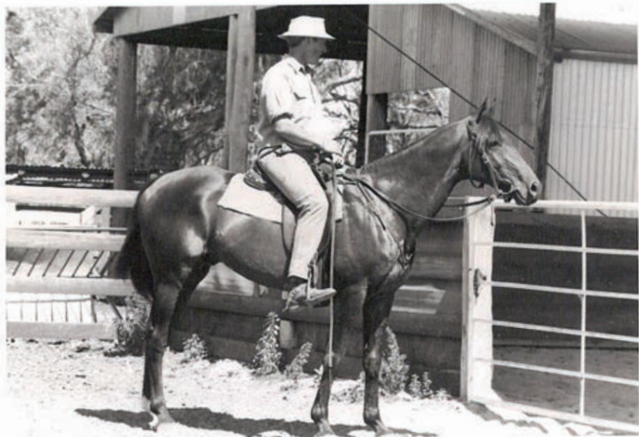
Top: JOHNSTONS DARK SECRET - FS HSH (wild buck 02/secret 08)