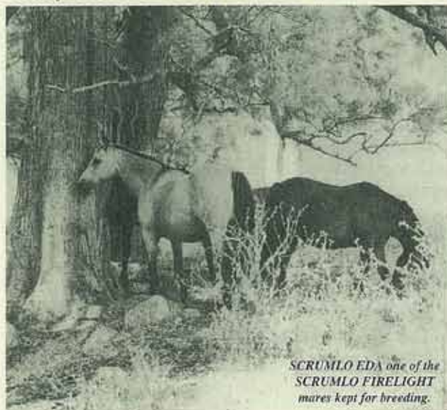
SCRUMLO EDA one of the SCRUMLO FIRELIGHT mares kept for breeding.