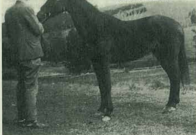
Branca Prudence (circa 1929) The great Scrumlo Matriach appears in the breeding of three ASH Foundation Mares, SCRUMLO VICTORIA, SCRUMLO NITA and SCRUMLO BRANCA PRUDENCE

Cadger was by Sylvander who was by Silvius, a brilliant performer on the track who won the MVCR Moonee Valley Cup, The VCR CB Fisher Plate and the VRC Melbourne Stakes. These races were over middle distance courses, 10 to 12 furlongs. Silvius has had a massive influence on our Australian Stock Horses for, as well as being the grandsire of Cadger, he is the sire of Doreen, the dam of Dimray and is double crossed in the pedigree of Jane, the mother of SUNDOWN.