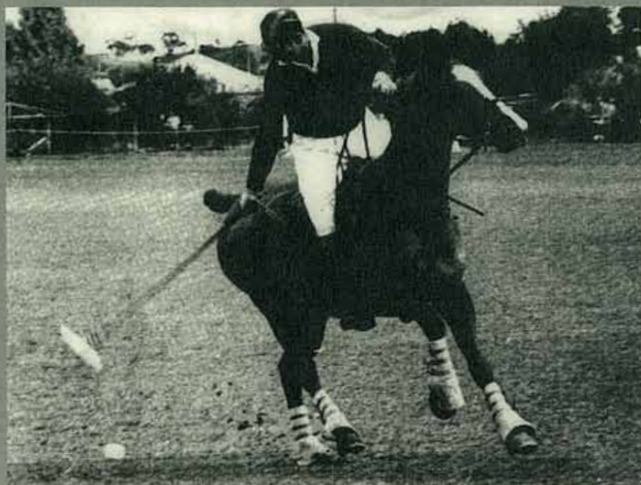
Champion Polo mare NABINABAH EASY GOING