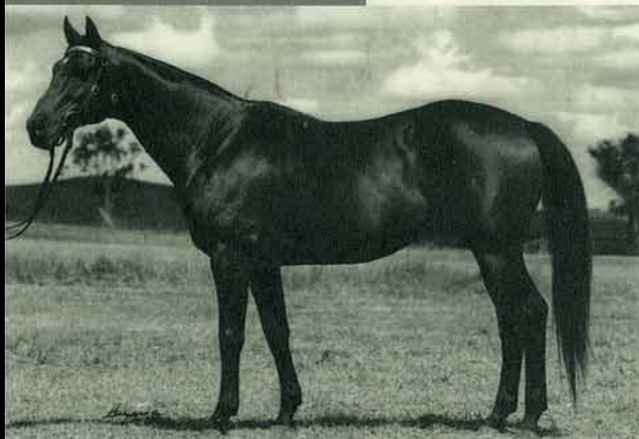
Well known stallion KYABRA CATTLE BARON has produced BOONARA QUICK SILVER (top) and BOONARA HOPE (below)

The third horse that helped tremendously was HAYDON NEVER DOUBT, a sire extensively used in the famous Haydon Stud. This horse has 80 registered ASH progeny. The Haydons obviously loved this line as they bred another sire