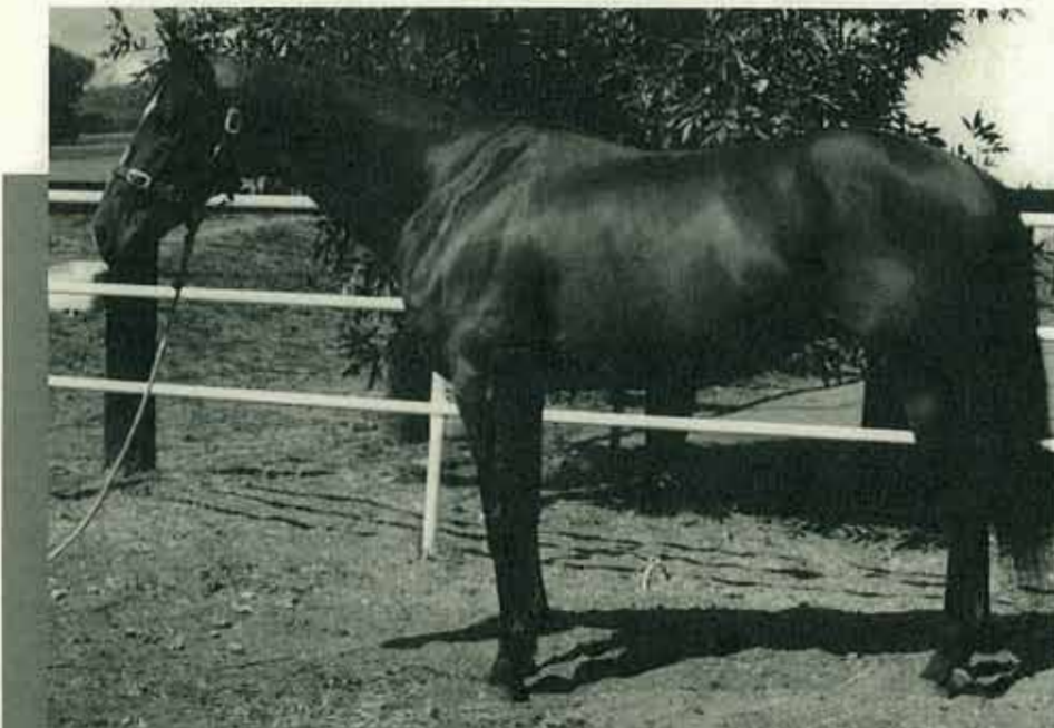
NABINBAH EASY GUN (above) has produced many great horses including BARNETTS MODEL (below) who was sold to the USA

NEVER IN DOUBT is like so many stallions, it is only when someone sits down years later and works out what he achieved that we realise the greatness of the horse.