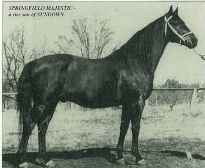
SPRINGFIELD MAJESTIC - a sire son of SUNDOWN

Champion Polo Pony Canberra 1968 and 1972, The Mitchell Trophy 1968 and 1971, The Hector King Trophy 1970 and the winning team of polo ponies, Adelaide 1968 and Tamworth 1970; Mr Jinx winner of many polo pony prizes including Champion at Sydney in 1971; Euchre, Champion Polo Pony, Dudley Cup 1973 and Musician, Champion District Hack, Goulburn Show.