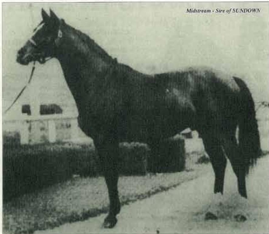
Midstream - Sire of SUNDOWN

Midstream was a bay horse, 16.1 hands high, imported to Australia in 1938 by Mr