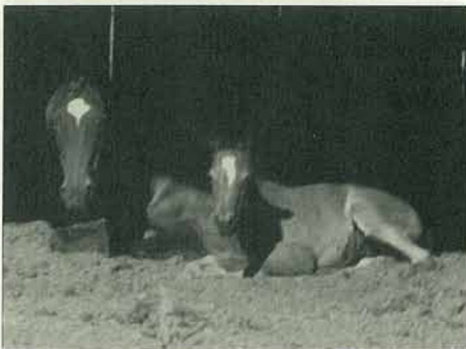
NABINABAH COMMA caught in relaxed mode with one of her 16 foals