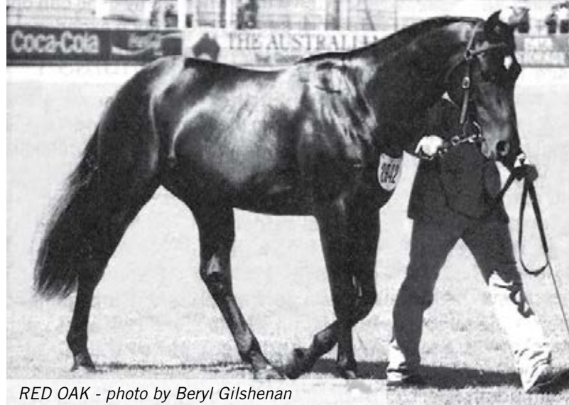
RED OAK

The early sales seem to have been quite pivotal in the development of the breed as some of the horses that changed hands at them have become foundation breeding stock for a number of present day studs. The demonstration prior to the sale must have set new standards as three of the people referred to in this story remember it well. RED RAY - FS entered the sale ring ridden by Dick, his one-armed rider, and put in an impressive workout. Loud applause came from the crowd - the only time all day. Two NSW women who have