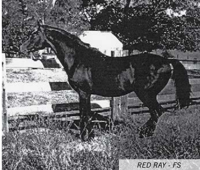
RED RAY - FS